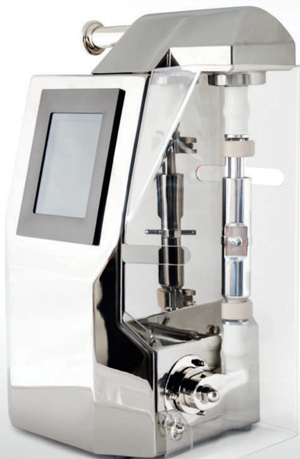
MALYS® VOLUMETRIC PISTON PUMP

PHARMACEUTICALS R&D CLINICAL TRIALS BIOPHARMA ADVANCED THERAPIES